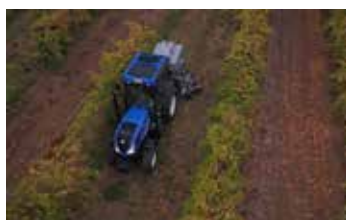
XPS VITICULTURE ORCHARDS