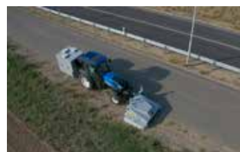
XPU URBAN APPLICATIONS