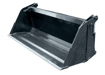
Bucket 4 in 1