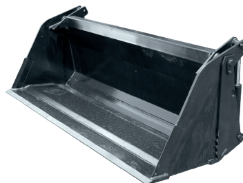
Bucket 4 in 1