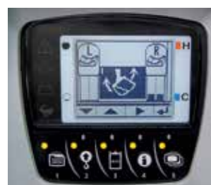
Max. Oil Flow Setting