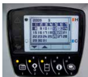
Operation History Record