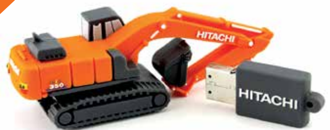
3D USB Excavator ZX350-6 8Gb