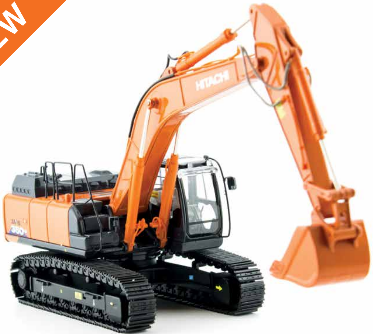
ZX350LC-6 Hydraulic Excavator Scale 1:50