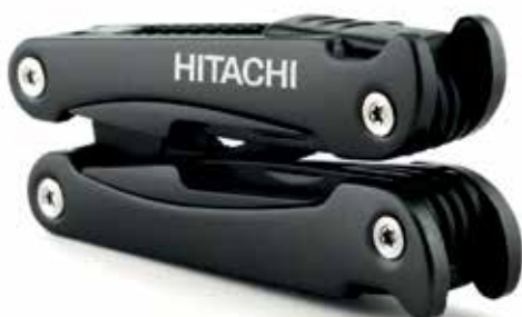
Multitool 13 functions