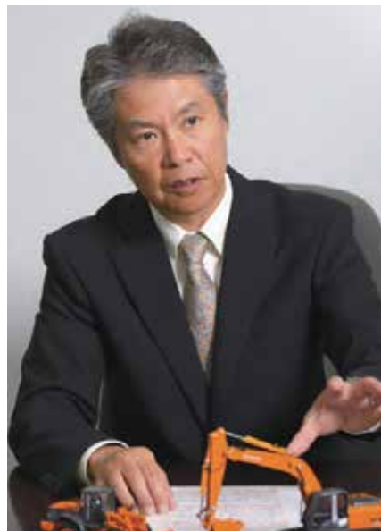
Life Cycle Support Operations Group Customer Support Division ConSite Development & Promotion Department General Manager

ConSite Monthly Report includes not only operation data, but also improvement suggestions automatically generated as based on trend analysis and engine operation time forecasts for the following year, assisting with maintenance cost